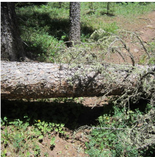
Engine Creek had a few downfalls