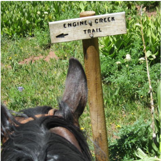
Take a sharp left here