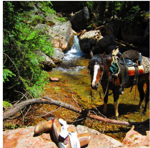
Ahh! Cool Stream near the bridge