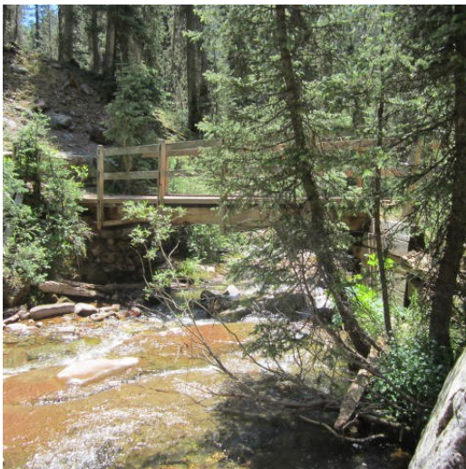
Bridge over Cascade Creek