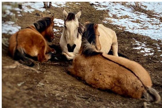
Her foal has gone to an adoptive home so Juniper has now been the patient nanny to 2 other Mesa Verde mustang foals that were recently weaned.

For more information go to www.NMACO.org or www.mustangcamp.org