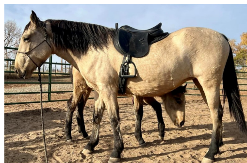
This Mesa Verde mustang mare is a beautiful buckskin, 5 going on 6 years old (born 2018).