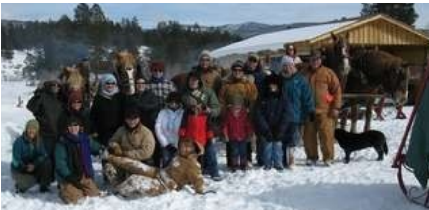
A sleigh ride at Rapp Corral later erupted in "the great snowball fight of 2013." Fun was had by all!